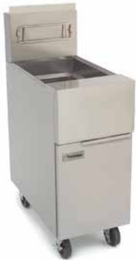
GF40 Shown with optional casters